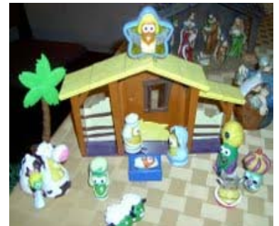
Christmas chreches (Nativity scenes) of all shapes and sizes were on display Dec. 27.