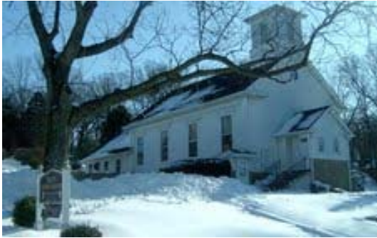
Trinity United Church's winter wonderland.